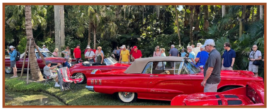
I looked at every car and think that at least half of the 40 entries were members of the Indian River Region, AACA!